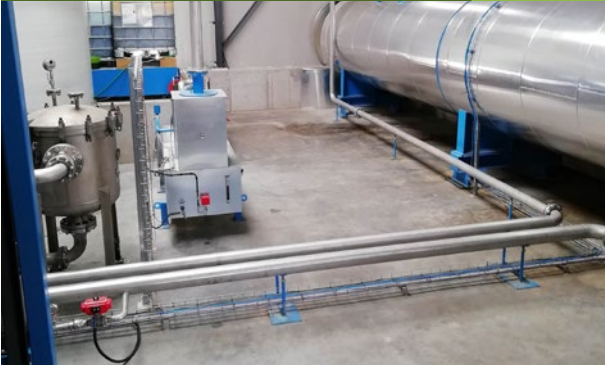
Bund area (containment) of the wood treatment plant and wood preservative storage tanks.