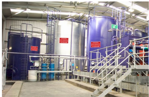
Storage tanks should display appropriate product and hazard labelling.

Storage and work tanks should be labelled with information about the product they contain and appropriate hazard labelling.