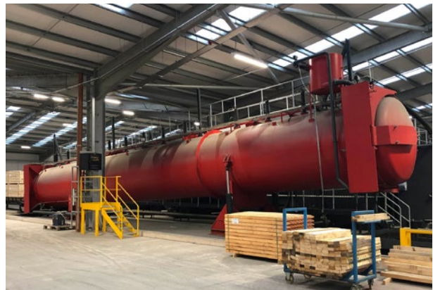
Treatment autoclave with tilting cylinder.