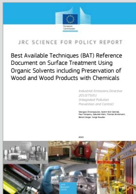
BREF/BAT reference document for wood preservation techniques.

This Code of Practice is a European code dealing with principles for safe design and operation of wood treatment installations. It does not replace or supersede existing national Codes of Practice. It may be used, however, as a model for national codes where they do not already exist or for updating existing codes to a standard acceptable to national regulatory authorities.