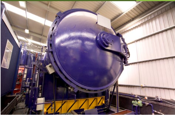
Autoclave door with safe locking device.