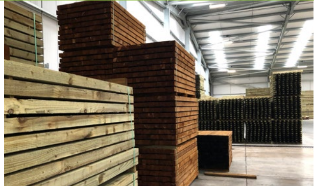
Under cover storage of freshly treated wood.