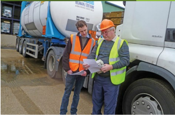
Bulk delivery of wood preservative.