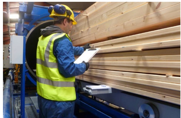
Process operator checks emergency preparedness.