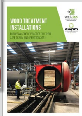
Wood Treatment Installation - European Code of Practice for their Safe Design and Operation 2021.