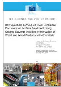
Supporting Guidance for Wood Treatment.

Note this Code of Practice uses 'should' throughout to indicate recommended best practice. Some aspects of plant design and operation are covered by mandatory legal requirements and wood treatment companies are responsible for complying with such mandatory requirements.